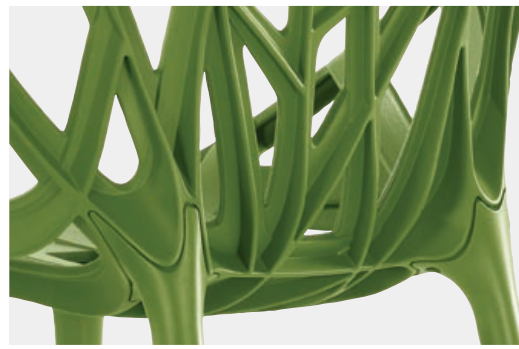
The asymmetrical design of the rear legs emphasise the chair's organic appearance.