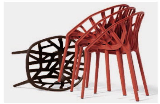
Vegetal can be stacked up to three chairs high.