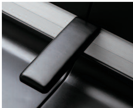
AE-8310 Black Polyurethane Arm