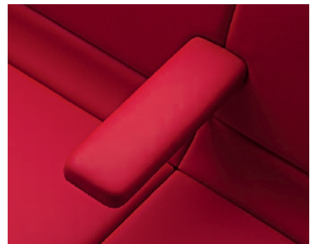
AE-8320 Upholstered Arm