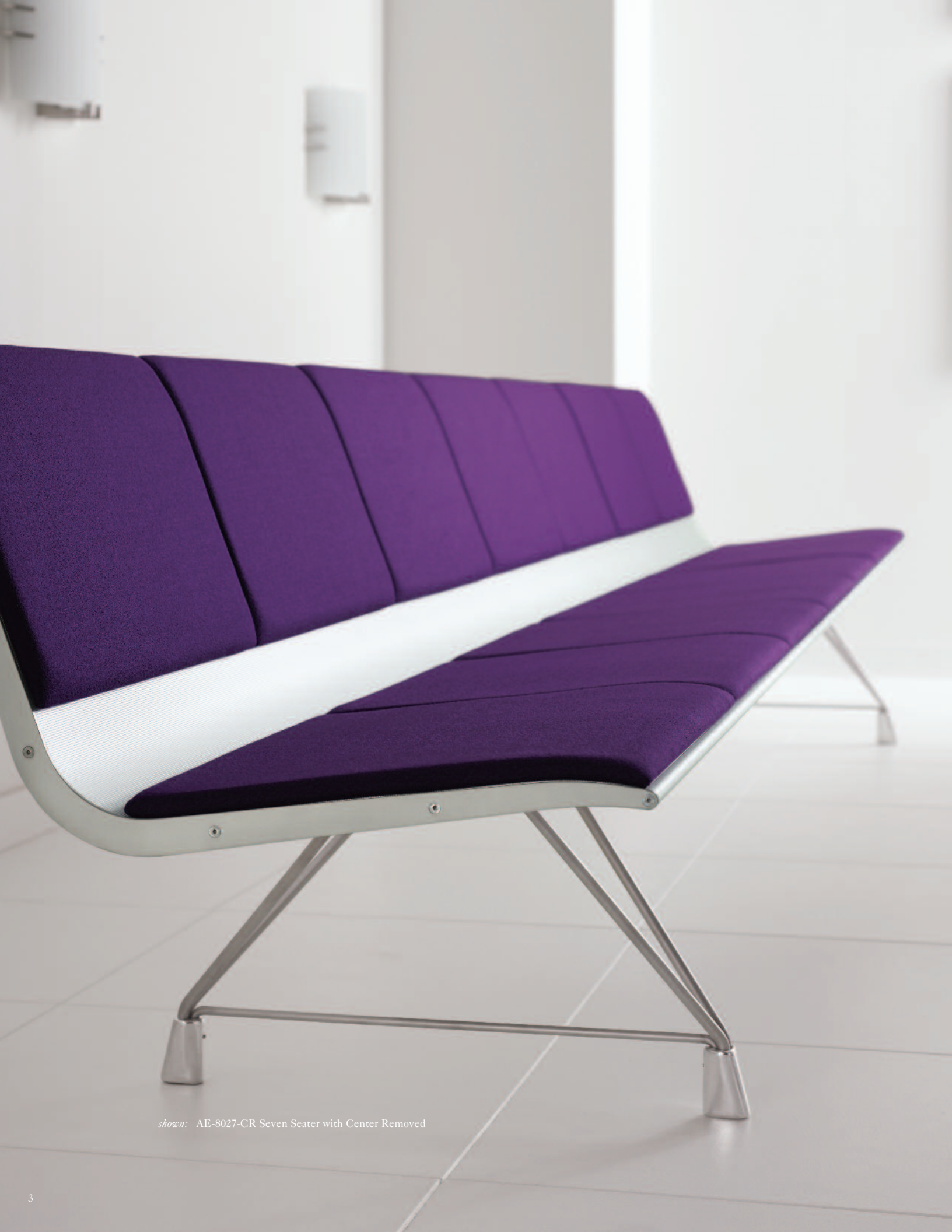
shown: AE-8027-CR Seven Seater with Center Removed