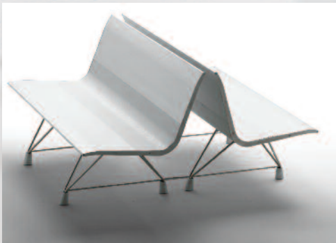
AE-8003 Three Seater Benches with AE-8500 Linking Device

shown: AE-8100 Three Seater Backless Bench