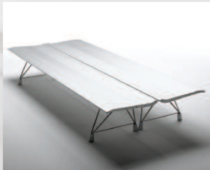
AE-8200 Four Seater Backless Benches