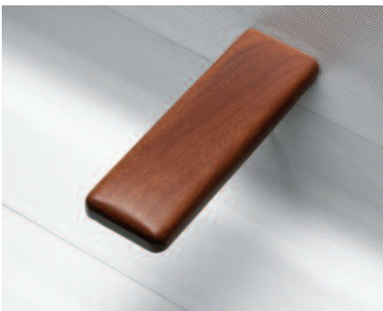
AE-8300-CC Wood Arm / 4000 Cherry