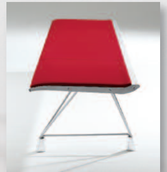
AE-8123 Three Seater Upholstered Backless Bench