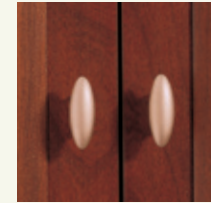
C51 Metallic Blonde Hardware

available on vertical storage and receptionist gallery units