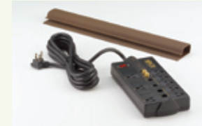
C73 Wire Management / Electrification Option

fully articulated keyboard arm with wood platform and leather wrist rest