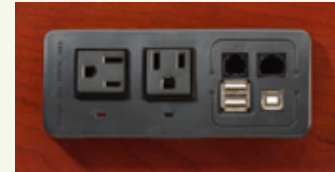
C97 Deluxe Data Port Option

fully articulated keyboard arm with adjustable metal keyboard clamp and black foam wrist rest