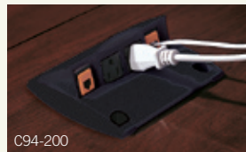
Electronic / Data Port Unit

matte black finish shown top brushed steel finish shown bottom.