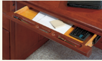
Standard Center Desk Drawer Construction