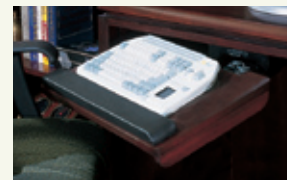
C60 1/2 Articulated Keyboard

fully articulated keyboard arm with wood platform and leather wrist rest — accommodates enhanced keyboard