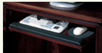
C60 Articulating Keyboard / Mouse Platform

may be specified in any desk, bridge, return or credenza