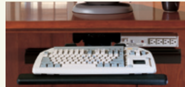
C59 Articulated Keyboard

matte black finish shown top brushed steel finish shown bottom.