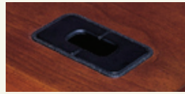
C65 1/2 Rectangular Black Grommet

solid zinc casting with matte black powder-coated finish.