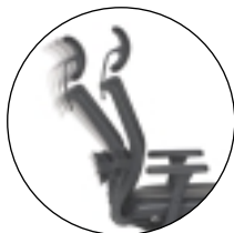
Phased two-step back release mechanism