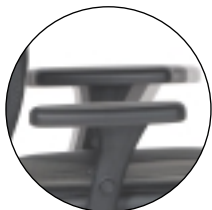
Adjustable arm pads*