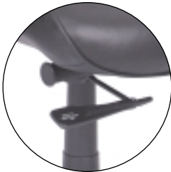
Gas lift with 3-1/2" range