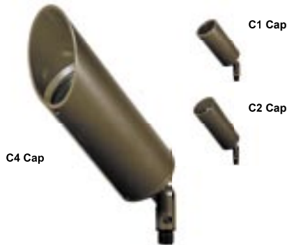
Model FL5 Line Voltage MR16 Halogen (75W) LED (2W)