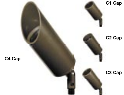
Model FL3 Line Voltage PAR16 Halogen (75W) PAR20 Halogen (50W) Fluorescent (9W) LED (2 1/2W)