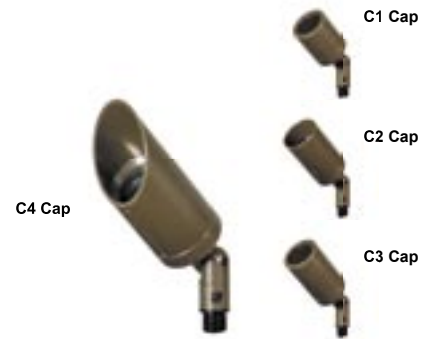
Model FL1 Low Voltage MR16 Halogen (50W) LED (2W)